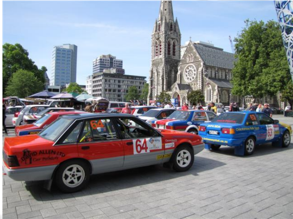
Wright / Gibbs Holden Commodore in Cathedral Square