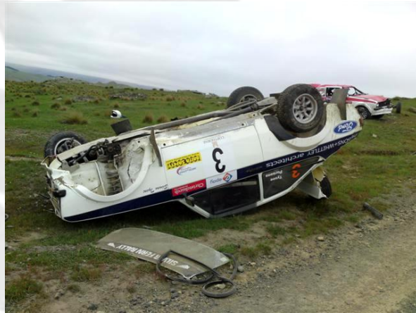
The Tysoe / Parsons & Schmarch / Graves RS1800's