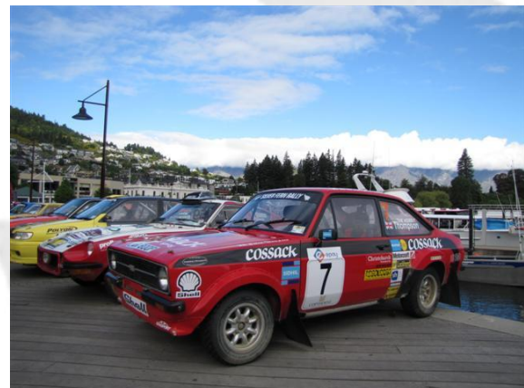
The Siddall / Thompson 'Cossack' Escort at Queenstown