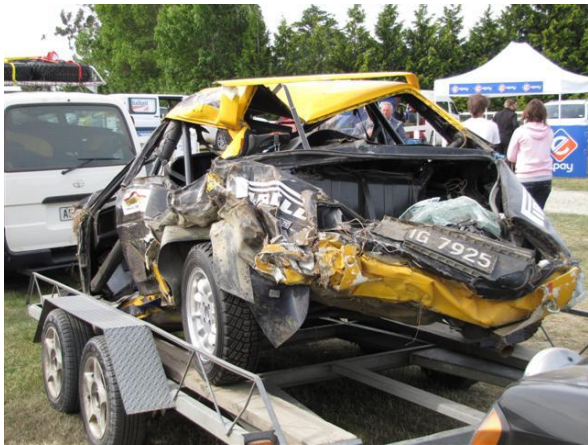
The very crumpled Aimers / Kendrick Fiat Abarth 131