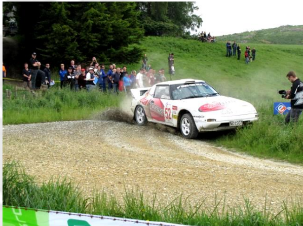
Hawkeswood / Johnstone shortening the road alignment