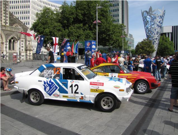
Fuge / Elder Mazda RX3 at the Ceremonial Start