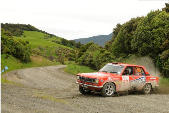
The quick Aussie Goldsbrough / Topliff Datsun 1600 (Ridder) Austrian's Polesnzig / Noelschider Porsche 911RS